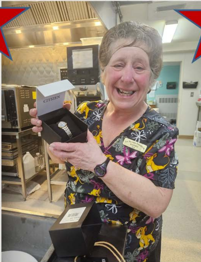
Photo from 15 yr. anniversary PVL