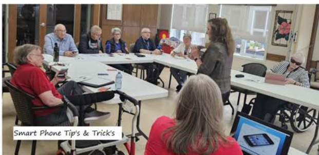
Smart Phone Tip's & Trick's