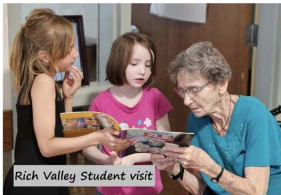
Rich Valley Student visit