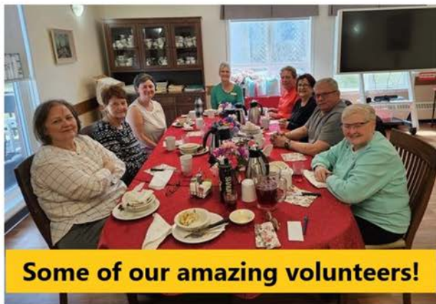
Some of our amazing volunteers!