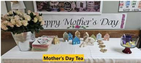
Mother's Day Tea