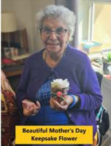
Beautiful Mother's Day Keepsake Flower