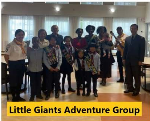
Little Giants Adventure Group