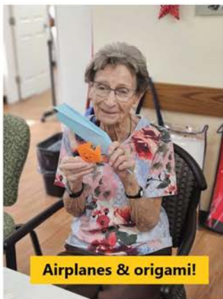
Airplanes & origami!